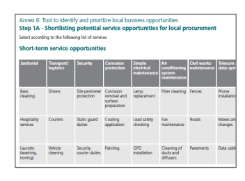
A user-friendly automated version of this tool is available online http://commdev.org/content/document/ detail/2729/