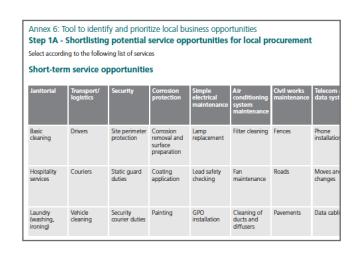
A user-friendly automated version of this tool is available online http://commdev.org/content/document/ detail/2729/